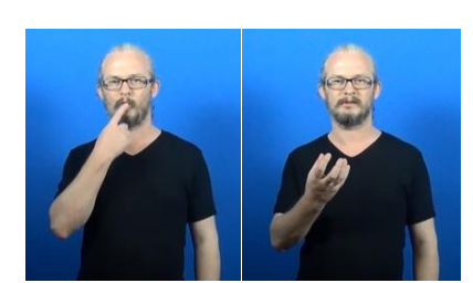
RED ^ CL.ROUND.OBJECT = 'tomato'

Leaving aside the variable order compounds, we can make the following generalization: endocentric compounds are overwhelmingly head-final, and exocentric compounds are overwhelmingly head-inital. As for the flexibility of order, overall 69% of the compounds have fixed word order.