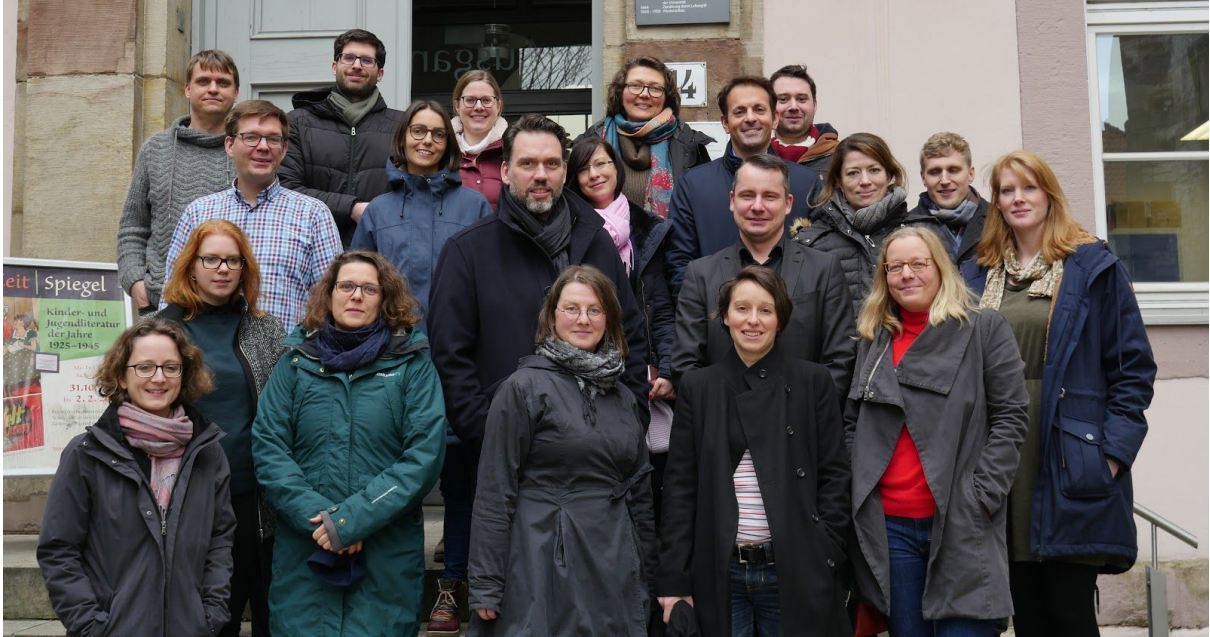
Some of the participants of the CO-OPERAS - SSHOC workshop, January 30th 2020

campus), information specialists (libraries) and research organisations (such as Max Weber Stiftung, Leibniz Gemeinschaft).