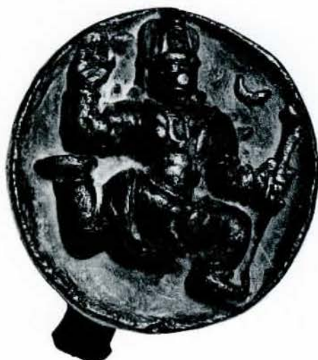
Ind. Ch. 42. Seal

J. F. Fleet, 'Sanskrit and Old-Canarese Inscriptions', in The Indian Antiquary , vol. vii, pp. 303-8. Epigraphia Indica , vol. vii, App. no. 357 (p. 64).