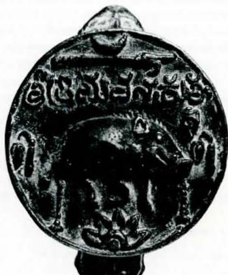
Ind. Ch. 14. Seal

Five copper plates (26×10 cm.) with raised rims held together by a cut copper ring with a round seal (8 cm. diameter). The legend Śrī Tribhuvanāmkuśa is written across the centre of the seal. Above it are the moon and an elephant-goad, below it a boar facing to the proper left, a śaṅkha -shell, two cauris , two lamp-stands, and a floral device.