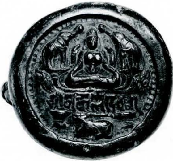
Ind. Ch. 44. Seal

One copper plate (47×31 cm.) with a ring hole at the top. The ring hole consists of a copper band held by rivets. The bell-shaped seal is exceptionally large and heavy. It shows, in relief, the goddess Lakṣmī sitting cross-legged in the middle of the seal. She is attended by two elephants who pour water over her. Underneath the goddess is written