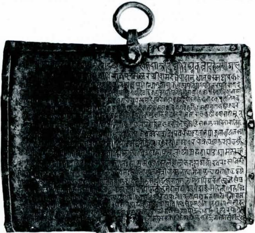
Ind. Ch. 34

F. Kielhorn, 'Four Rewah Copper-plate Inscriptions', in The Indian Antiquary , vol. xvii, pp. 227-30. Epigraphia Indica , vol. v, App. no. 186 (p. 27).