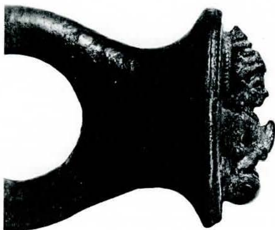
Ind. Ch. 52. Seal