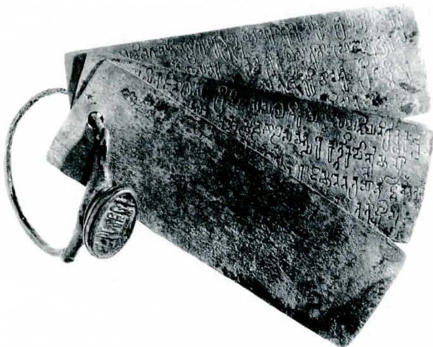
Ind. Ch. 59

The grant was made by the Kadamba king Ravivarmā who gave the village of Purukhēṭaka to the mother of his own father. ' . . . the Lord Ravi established the ordinance at the mighty city of Palāśikā, that the