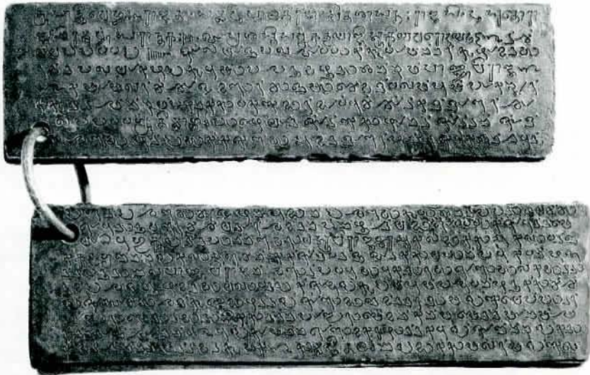
Ind. Ch. 4. Example of Vatteṛuttu script

the king at once called him mildly and was pleased to ask him first: "What is your complaint?" The bystander submitted thus: "Oh mighty king of powerful army. Formerly without swerving from the pure path prescribed by law, the village called Vēļvikuḍi included in Pāgaṇūr-kūṛram, whose flowery groves touched the sky, was designated Vēļvikuḍi . . . was granted through the Kēlvi [Brahmins] by your ancestor, the great lord known as Palyāgamudukuḍumi Peruvaṛudi, who protected the earth girt by the ocean with an army of spearmen who never