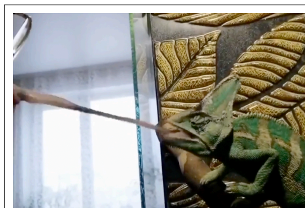
Fig 1. Chamaeleo calyptratus tongue-punching a man in his nose

It was only in 2007, when I observed at daytime an interaction of a Pearl-Spotted Owlet – Glaucidium perlatum (VIEILLOT, 1817) and a big male of the Yellow-Crested Jackson’s Three-Horned Chameleon – Trioceros jacksonii xantholophus (EASON, FERGUSON & HEBRARD, 1988), sitting on a tree in a height of around 5m from the ground in the eastern suburbs of Meru, E-slopes of Mt. Kenya, Kenya. The owl was sitting motionless on a horizontal branch around noon and looking forwards. The chameleon was moving slowly through the canopy of same tree, it selected the same branch and unintentionally moved slowly closer to the owl and approached it from the side. As the branch was leafless and exposed, about 40 cm