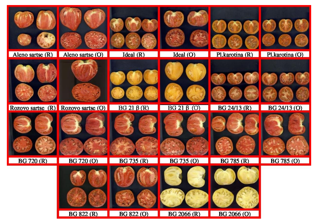
Figure 2. Scanned fruits of the studied indeterminate tomatoes grown under reduced irrigation (R) and optimum irrigation (O)

Stronger unfavourable effect of the reduced irrigation in determinate tomatoes for processing was recorded on the appearance, followed by the shape, texture, aroma and total sensory evaluation (Table 3, Figure 3). By analogy with indeterminate tomatoes, the evaluations for sweetness were higher for the fruits grown in water deficit than the fruits grown in optimum watering regime. Reduced irrigation did not result in external and internal colour, peel tenderness, sourness and overall taste. The influence of reduced irrigation as a single factor on these sensory traits was insignificant.