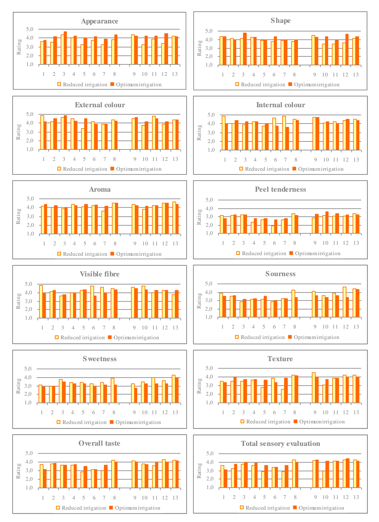
For processing: 1 - Kapri; 2 - Neven; 3 - Pautalia; 4 - Venera; 5 - BG 160; 6 - BG 985; 7 - BG 1527; 8 - 2086 For fresh consumption: 9 - Marti; 10 - Milyana; 11 - Solaris; 12 - Spektar; 13 - BG 252 Figure 3. Sensory characteristics of the determinate tomato accessions