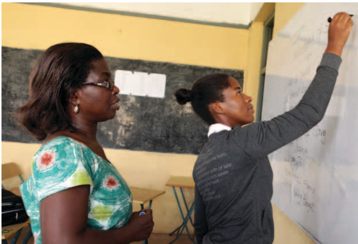
Student teachers need to be provided with opportunities to practise writing on the white board or black board.

Instruct the Student Teachers to share their findings with their TP partner. They should compare what items were on their checklist that the teacher did not keep a record of, and their notes on how any such omission can affect pupils' learning.