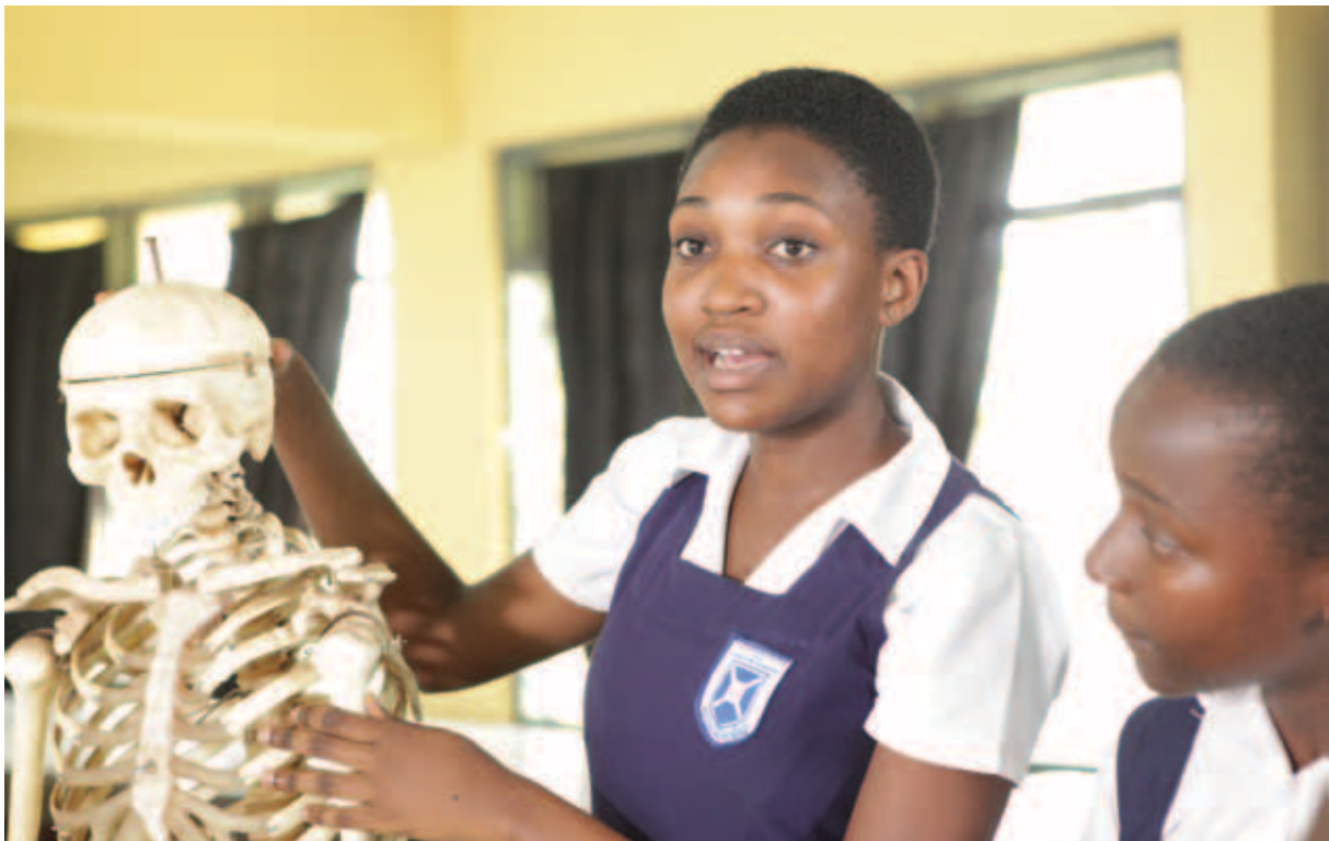
Student teachers must encourage female pupils to develop their interest and participation in science lessons.