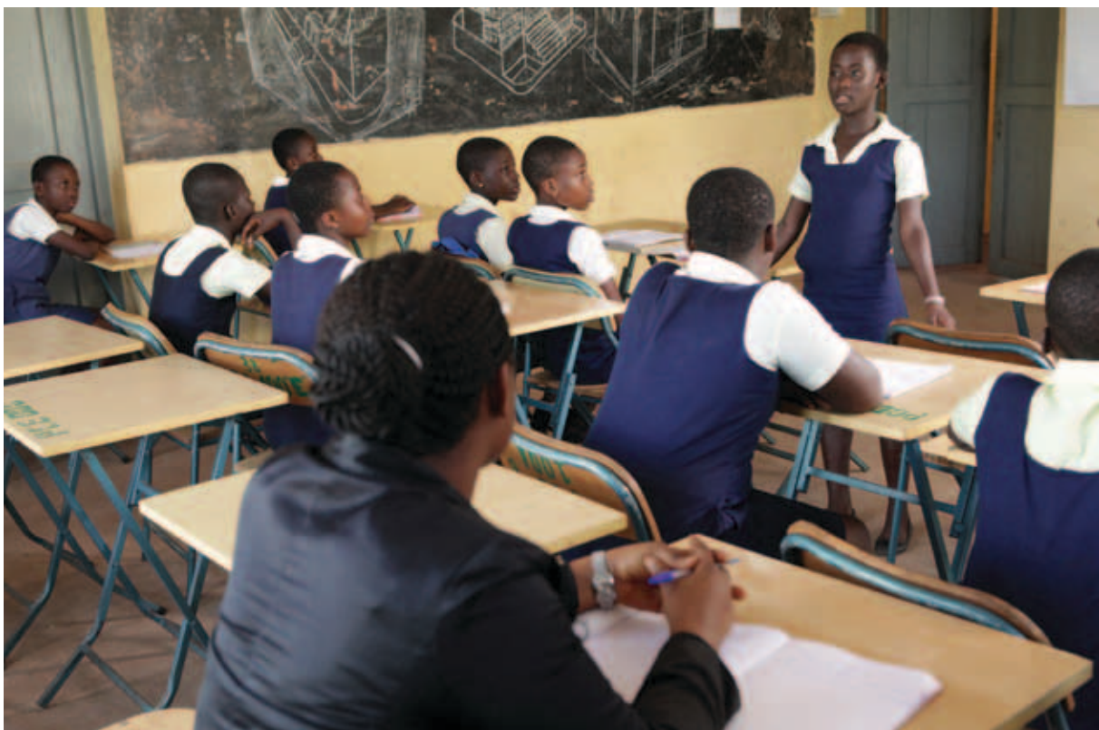
Lesson observation is an important activity for student teachers and mentors to undertake during teaching practice.

After the Y1 School Observation is completed and during the post-TP activities, find out from Student Teachers their ideas for alternative ways to disciplining children in the class instead of bullying and corporal punishment. Explain any additional ideas they may not have thought of.