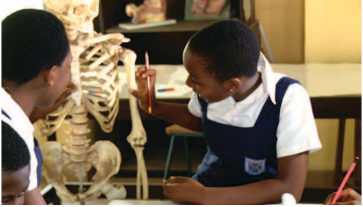
Using TLMs in science lessons stimulates and sustains pupils interest in learning.

The Student Teachers will record the action points from the discussion in their TP Journals.