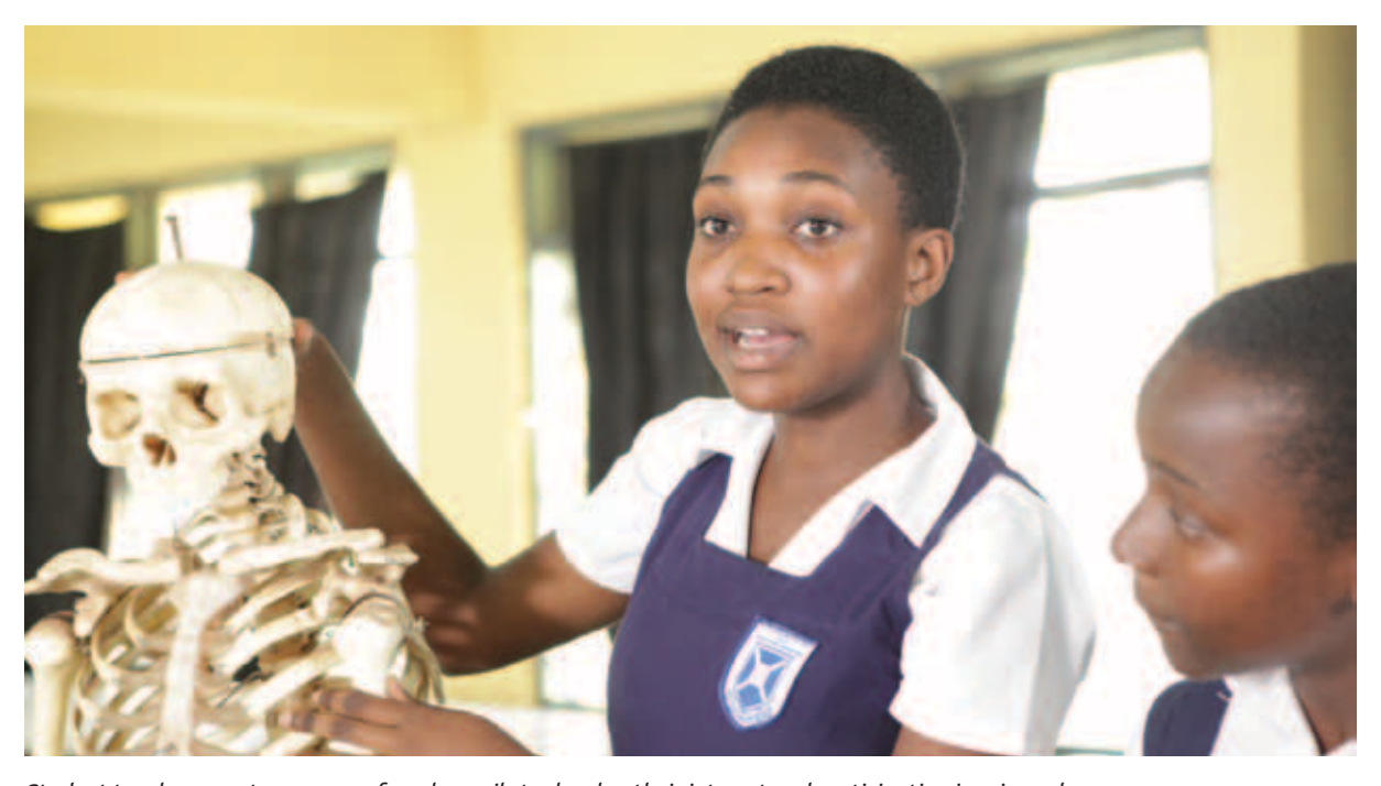
Student\ teachers\ must\ encourage\ female\ pupils\ to\ develop\ their\ interest\ and\ participation\ in\ science\ lessons.

As a Mentor, you may conduct further discussion with the Student Teachers using these questions when they arrive at your school at the start of their Y3 TP.