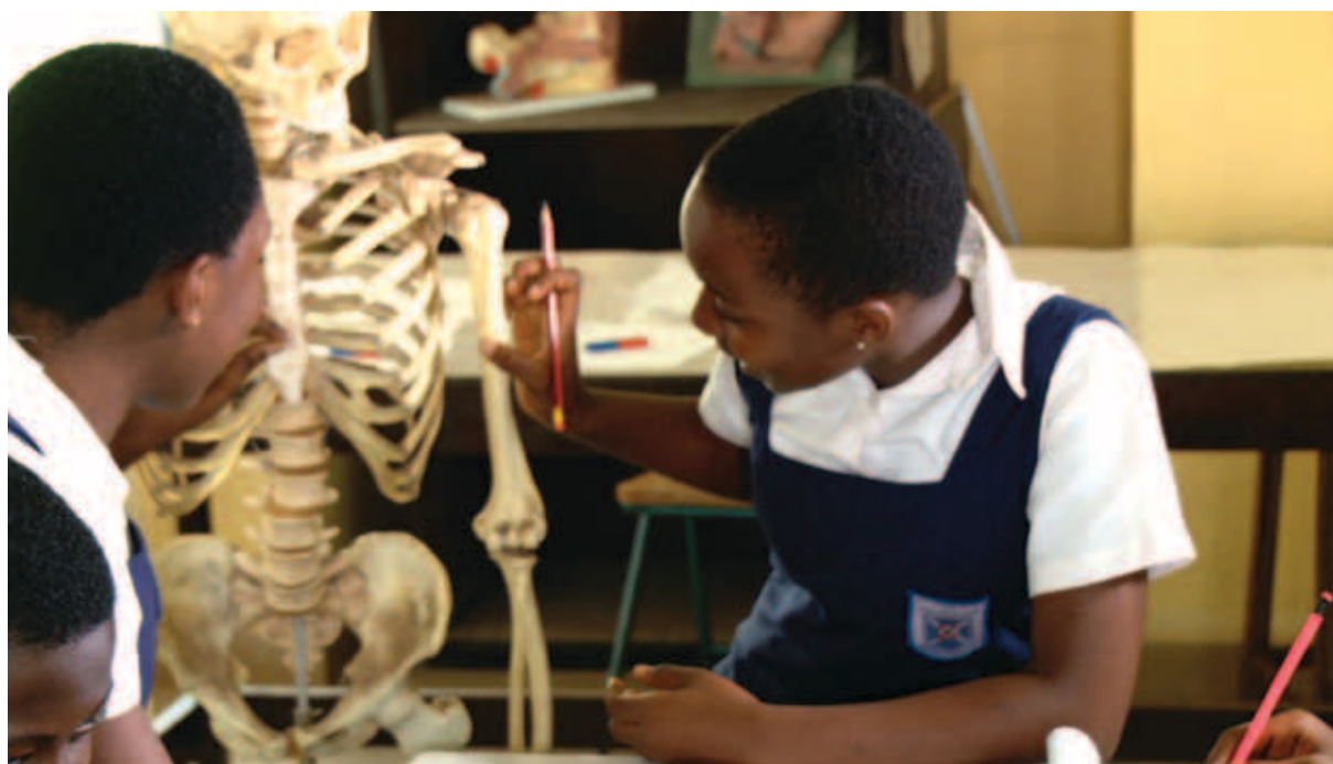
Using TLMs in science lessons stimulates and sustains pupils interest in learning.

The Student Teachers will record the action points from the discussion in their TP Journals.