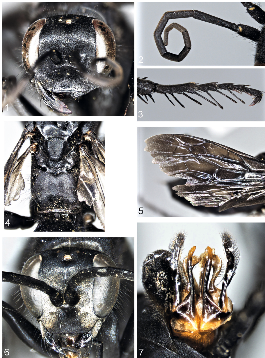
Figs 1-7: (1) Arachnospila satyrus ♀, face; (2) antenna; (3) foreleg; (4) propodeum; (5) wing; (6) face; (7) Arachnospila satyrus ♂, genital dorsal view.