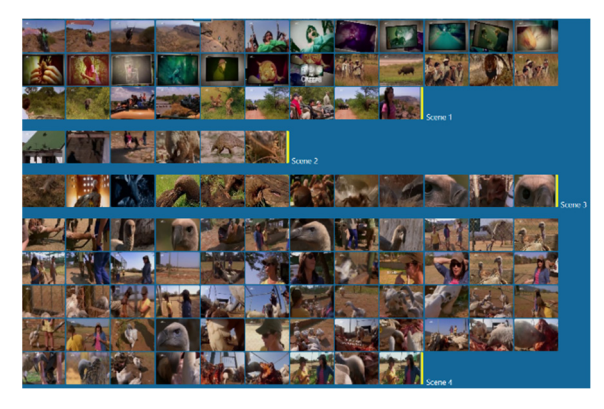
Figure 3: Interface of the visual analysis service with scene and shot segmentation.

The foundation for ReTV's generous interface is the visual analysis service. Video segmentation into individual shots allows us to provide a breakdown of all concepts detected on a shot level. It is also possible to perform concept-based search and retrieve all shots from a video that contain a specific concept. Such fine-grained functions increase the possibilities of locating more unexpected video segments, especially for content that would not be discovered otherwise due to the lack of descriptive metadata.