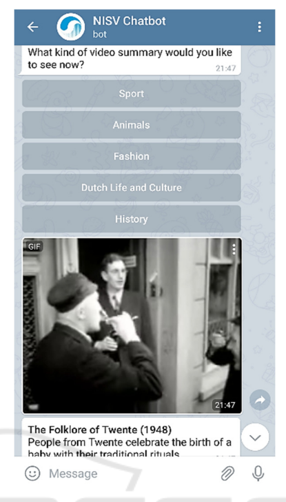
Figure 2: Screenshot of the ReTV chatbot.

see the item in the online collection operated by the archive.