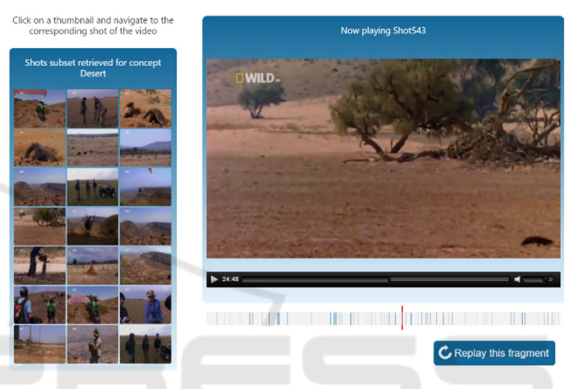
Figure 4: Interface of the visual analysis service showing the retrieval of shots that depict a selected concept.

For creators using MAMs, a generous interface based on visual analysis of time-based media could provide significant support for conducting "image search" - finding relevant video segments that could be reused to illustrate narratives in their productions. It creates affordances for a more serendipitous content retrieval, one that can guide and inspire new creative narratives (Sauer, 2017). In particular, it would make archival systems more accessible to amateur creators who do not have pre-existing knowledge about broadcaster collections. To provide an even more comprehensive analysis of audiovisual content, such generous interfaces could combine a number of AI-powered services, e.g. concept detection together with face recognition and speech analysis.