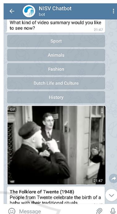
Figure 2: Screenshot of the ReTV chatbot.

see the item in the online collection operated by the archive.