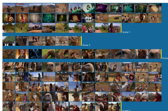
Figure 3: Interface of the visual analysis service with scene and shot segmentation.

The foundation for ReTV's generous interface is the visual analysis service. Video segmentation into individual shots allows us to provide a breakdown of all concepts detected on a shot level. It is also possible to perform concept-based search and retrieve all shots from a video that contain a specific concept. Such fine-grained functions increase the possibilities of locating more unexpected video segments, especially for content that would not be discovered otherwise due to the lack of descriptive metadata.