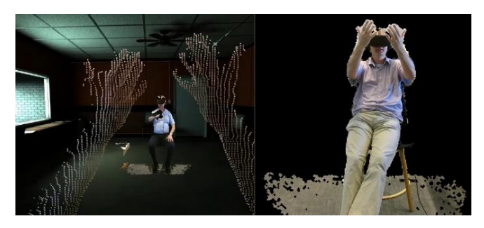
Figure 1: Social VR Application: Environment with other user and self-representation (left) and user capture (right).

LEAVE 0.5 INCH SPACE AT BOTTOM OF LEFT COLUMN ON FIRST PAGE FOR COPYRIGHT BLOCK