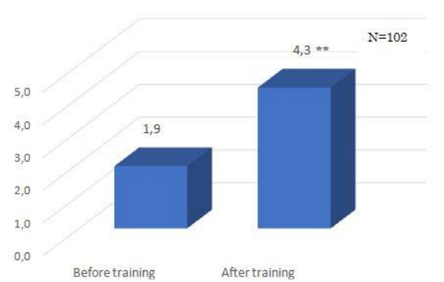
Figure 3: Practice level of activities for the prevention of dementia. Paired p-test, ** significant at 1% level.