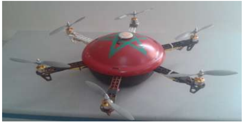
Figure 1:- A picture of the developed hexarotor(SMART\ENSEM).

An illustration of our study will be given in an application of control of an autonomous hexarotor developed by the team architecture of systems, to the ENSEM of Casablanca.