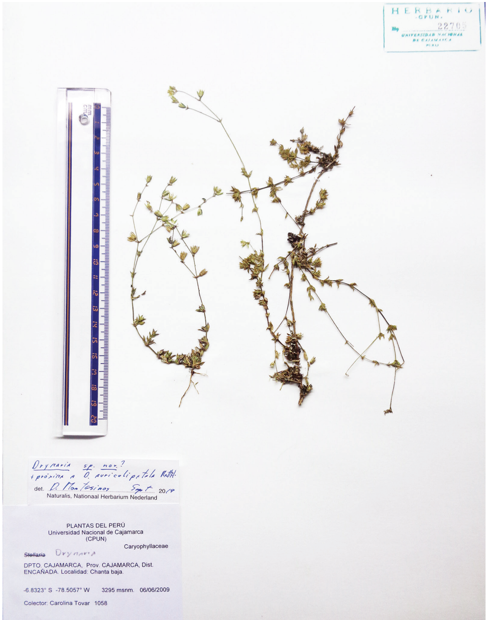
Figure 2. Holotype of Drymaria veliziae (CPUN-22705!).

lucid to brownish with age, rarely bifid or trifid; bracts opposite, 2.5–3 mm long × 2 mm width, involute, cupuliform, irregularly ovate, margins covered with scattered glands, surface white coloured with lilac blotches. Flowers except the first formed, axillar and solitary at the end of the branches, base protected by the bracts (in pairs 1 or 2). Pedicels 1–2 mm long, densely glandular and covered with carinate plicate trichomes, rarely aerial, of about 0.2–0.4 mm. Calyx cylindrical-campanulate; sepals 5, equal,