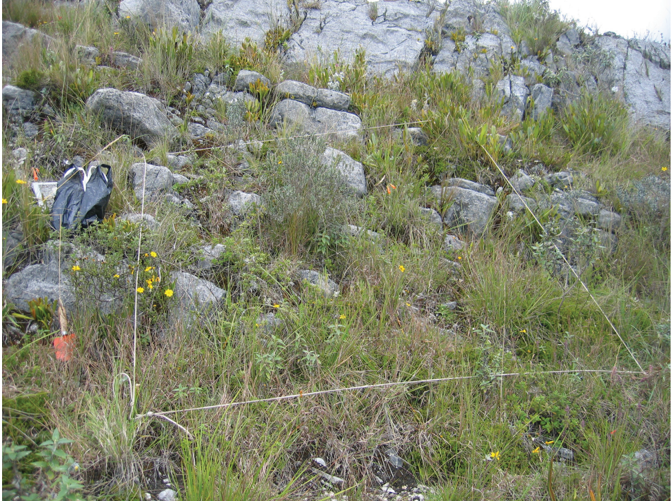
Figure 4. Quadrat where the new species was found. Chanta baja, Encañada District, 3295 m elev.

5–6 mm long \times 2–2.2 mm width, glabrous, elliptic-ovate, apex apiculate and aristate, basally truncate, 3–5 nerved; petals 5, 5–7 mm long \times 1.8–2.2 mm width, bifid about half their length, elliptic, apex rounded, 1–1.2 mm width, 8–10 nerved, constricted at the junction of the lobes; stamens 5, 2–2.2 mm long, anthers oblong, 0.2–0.3 mm long; ovary roundish, 1–1.4 mm long, slightly exceeded by the anthers; style 1–1.2 mm long, trifid about half its length, stigmatic branches twisted or coiled. Capsule ovoid, 1.4–1.6 mm long, 5–8 seeded. Seeds roundish, reniform, 0.6–0.9 mm long \times 0.6–0.8 mm wide, granulate, ventral surface with roundish-acute tubercles, black to dark brown in colour.