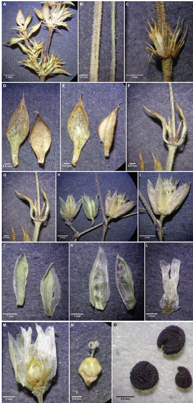
Figure 3. A. Internode and leaf arrangements B glandular stems C crown of stipules at the leaf axis D leaves (adaxial side) E leaves (abaxial side) F axis of leaves G bracts at the leaf axis H mature and immature flowers I flower detail J sepals (adaxial side) K sepals (abaxial side) L single petal with bifid apex portion M flower with ovary, stamens (indicated with dark lines) and style N ovary detail with a trifurcated style O seeds.