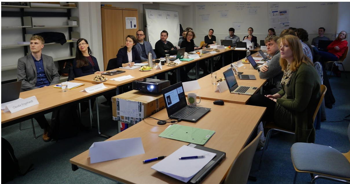
Audience following the presentation on FAIR principles in the SSH

In the following the feedback is clustered along various paragraphs without a certain hierarchy in the list.