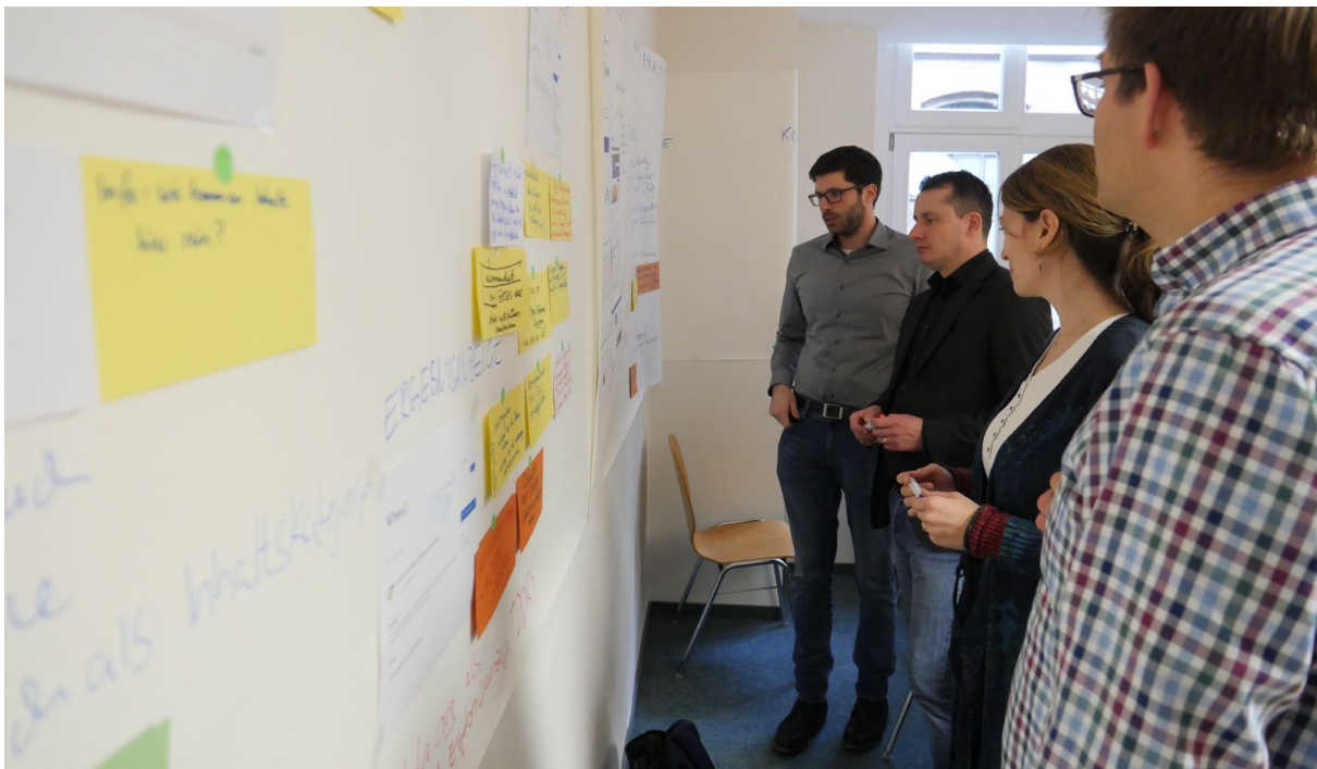
Filling posters with ideas, feedback, critic along selected or self-chosen marketplace topics

The workshop was split in two parts: in the morning presentations and a group discussion regarding FAIR principles in the SSH had been conducted. The afternoon session was devoted to discussing the SSH Open Marketplace to involve the user community in the development of the platform (participatory design, user involvement). The marketplace session was realised as group work along pre-selected topics. The organisers tried to apply activating methods and shifting of setting: collecting feedback in groups on posters, a moderated group discussion led along selected topics, talks with subsequent discussion.