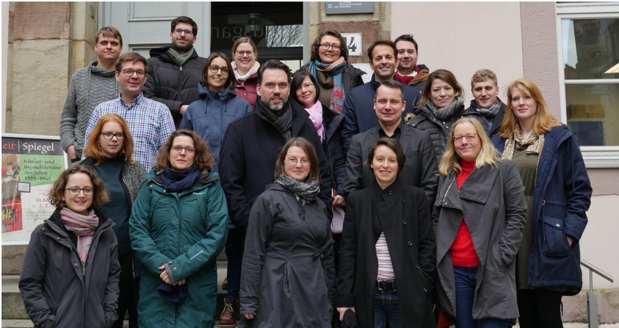
Some of the participants of the CO-OPERAS - SSHOC workshop, January 30th 2020

The overall comfortable and informal discussion atmosphere was well received with the participants and lead to a nearly complete consent to get prospectively involved in the development of the SSH Open Marketplace.