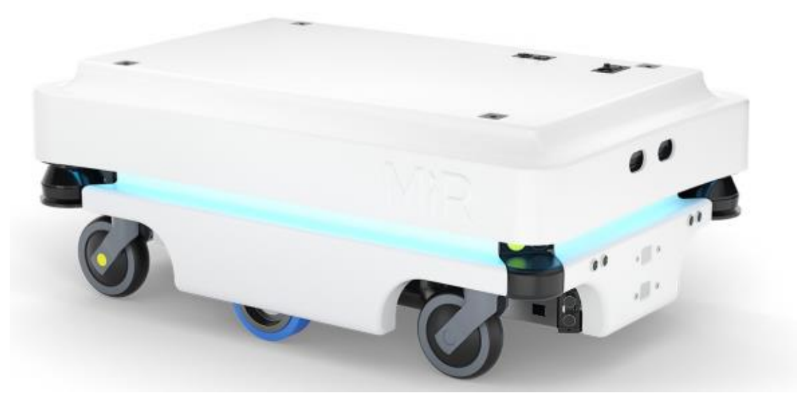
Fig. 1. Mobile robot MiR100 – Available in digital factory of UAS Technikum Vienna [5]

The safety ring will be implemented on a state-of-the-art mobile robot at the UAS Technikum Vienna. More precisely on the MiR100. This mobile robot can be arbitrary upgraded on its top. In this case, for different research projects, the MiR100 got upgraded with an aluminium framework and a Universal Robot (UR) 5 on the top of it. But this additional framework makes the MiR100 not safe for every situation. The MiR100 has two SICK S300 Professional laser scanners, an Intel RealSense 3D camera and four Ultrasonic safety sensors to detect obstacles, but they are designed for a height of the robot of 995mm. With the UR5 mounted on the mobile robot, the height is more than 995mm, so additional safety sensors are needed to detect obstacles, which would crash into the aluminium framework or even into the UR5.