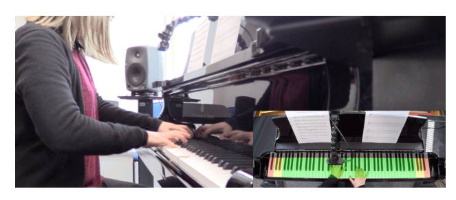
Figure 2: Lateral and eagle eye view of Reach with colour coded detection areas.

ulation parameters. This tracking data, coming from the joints of the fingers, palms and wrists, is then received by a Pure Data patch, where it is mapped to sound modulation parameters.