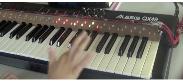
Figure 1. MIDI controller mounted with a LED stripe.

NIME'19, June 3-6, 2019, Federal University of Rio Grande do Sul, Porto Alegre, Brazil.