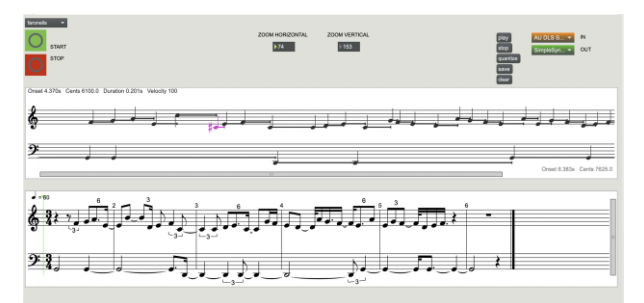
Figure 3. AMIGO's interface displaying the music notation feedback.

We created a GUI for AMIGO, for which a screenshot is shown in Figure 3, to allow the user to visualize the musical output using music notation. This includes two main scores. The upper score displays the bass line and the note instructions from users in real time by associating time to spatial distances between notes. The lower score displays a metrical version of the musical output by quantizing the temporal information into rhythmic values within the time signature of the original MIDI file. Changes to pitch and duration can be done at later stages by user manipulations of both of these representations. Moreover, the GUI allows the user to export the scores as MIDI files.