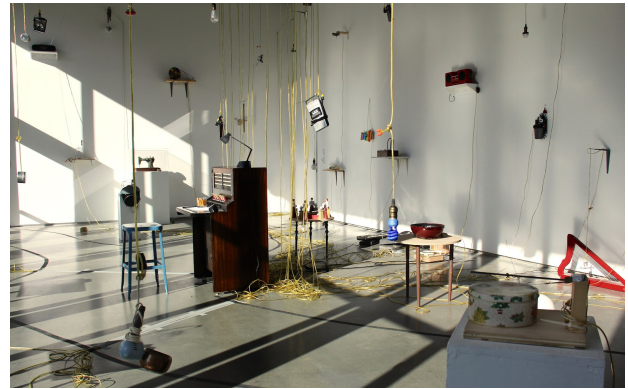
Figure 6: Chorus for Untrained Operator

Peter Bussigel and Stephan Moore's Chorus for Untrained Operator is a collection of discarded objects, each relieved of its original responsibilities and modified to emphasize its musical voice. The ensemble is operated via the patch bay of a repurposed 1940s telephone switchboard. The objects—an electric tie rack, an 8mm projector, an animated shoe, a sewing machine—are chosen for their audiovisual characteristics, and lightly modified to produce the varied voices of the mechanized chorus. Each time the piece is installed, new objects are found and older objects evolve (and break).