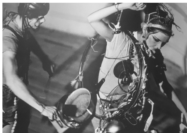
Figure 2: Carolee Schneemann performs Noise Bodies

In 1965, as part of Charlotte Moorman's 3rd Annual Avant-Garde Festival, the performance artist Carolee Schneemann presented a work called Noise Bodies in collaboration with the musician James Tenney. For the performance, which took place at New York City's Judson Hall, Schneemann and Tenney wore complicated arrangements of readymade sound objects, designed such that each person's body presented a variety of cacophonous options to the other during performance. According to Schneemann's gallery, these objects included "refrigerator tubes, ice trays, carburetor vents, beer cans, necklace beads and flashlights." [3]