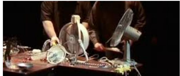
Figure 4: Losperus in performance

Losperus is a performance piece by Evidence (Stephan Moore + Scott Smallwood) that uses small microphones, resonant objects and commonplace motorized devices to create a dense, evolving texture of amplified sound. A typical performance begins with a large clean table in the center of a large space, equipped on either end with power outlets. A small mixer sits in the middle, and six tiny microphones are connected and ready. One oscillating fan, or maybe two, are placed on the table and turned on. After a while, a performer carefully alters one of the fans in some way. This may involve placing the fan on its back, or stopping it, attaching a small weight to one blade, and turning it back on, creating a vibrating, unstable situation. Soon, more objects are placed on the table: a metal bowl, a plastic letter tray, things that tend to produce interesting sounds when vibrations are introduced.