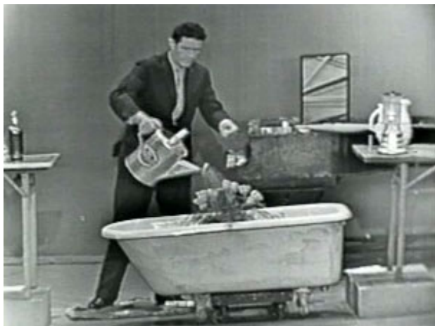
Figure 1: John Cage performs Water Walk

John Cage's 1958 composition Fontana Mix consists of a set of materials useful for creating other compositions: several sheets of squiggly lines of various thicknesses, transparent sheets speckled with dots, and then other transparent sub-sheets for describing and measuring the relationships formed by various combinations of the dots and lines. These readings could result in an infinite number of realizations, which were, in turn, to be used to describe musical parameters for fixed compositions. Cage himself used the Fontana Mix system to create several other of his compositions, including Aria , Theater Piece and WBAI .