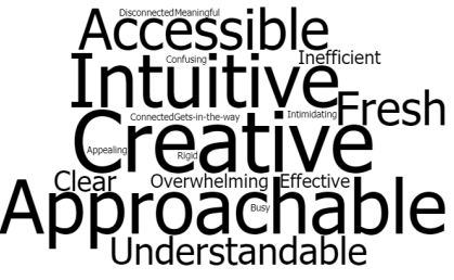
Figure 3: Wordcloud of all selected keywords

who's never used a mixing desk before". It was also suggested that this apparent affordance lent the use of CEQI to educational contexts.