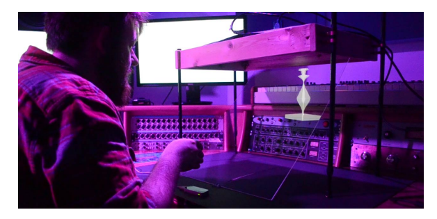
Figure 2: CEQI in use

CEQI was developed in HTML 5 and JavaScript using the Web Audio API to perform spectral analysis and modification. Given the relative restrictions of Web Audio's analyser node for spectral manipulation, a constant Q transform bank of biquad filters spaced at 1/3 octave bands was employed. Each filter was connected to an analyser node to calculate real time and average energy (RMS) and a gain node to alter the relative level of each band. Graphical visualisation was provided via the HTML canvas and easel.js with the real time and average RMS visualisations drawn as overlain opaque shapes. Leap.js controlled interaction by tracking palm position and palm rotation angle. Hand position was displayed as a circular cursor to provide user feedback.