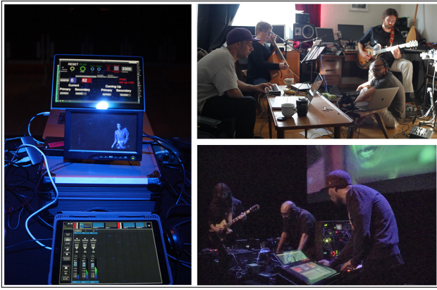
Figure 3: Left: The Intermediary Conductor’s station. Top right: Rehearsals in Reykjavík. Bottom right: Performance at Lakeside Arts, Nottingham.

then chosen to select individuals to wear the BCI headset and control the interactive film for back-to-back screenings. This double bill format not only produced 48 minutes of film content for the performers to accompany, it was also intended to embed comparison within the experience, encouraging the audience to identify differences between the screenings and appreciate the musical variety.