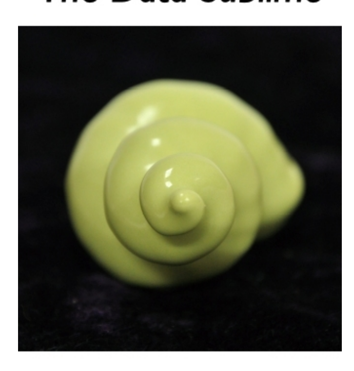
A Poetics of Data