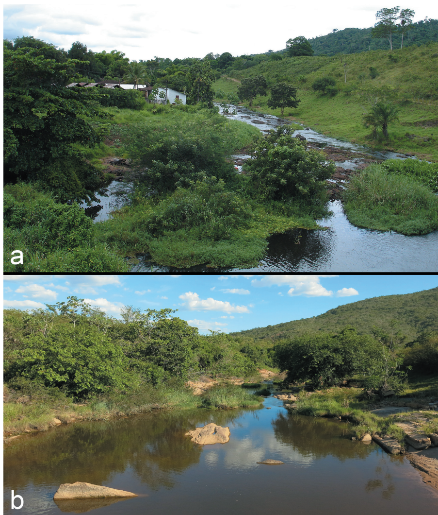
Fig. 5. Collecting sites of Astyanax varii : (a) type locality, Brazil, Bahia State, Ubaitaba, Fazenda Progresso, rio Coricó, lower rio de Contas basin; (b) Brazil, Bahia State, Jussiape, Caraguataí, rio Água Suja at Balneário Rio da Barra, upper rio de Contas basin.

The analysis of stomach contents of two specimens of A. varii revealed the presence of allochthonous and autochthonous items, composed predominantly by filamentous algae and fragments of vascular plants and seeds, organic debris, insect aquatic larvae (Diptera: Chironomidae and Simuliidae) and fragments of unidentified insects.