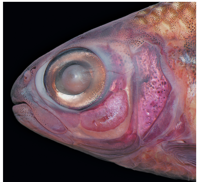
Fig. 2. Head of Astyanax varii , UFBA 8380, paratype, 40.8 mm SL, 9.3 mm HL, alizarin stained, lateral view, left side.

Head somewhat pointed to rounded anteriorly in lateral profile. Mouth terminal; upper jaw similar in length anteriorly or slightly longer than lower jaw. Posterior terminus of maxilla extending beyond vertical through anterior margin of orbit. Infraorbital series moderately developed; ventral margin of third infraorbital falling distinctly short from horizontal limb of preopercle and leaving a relatively broad area without superficial bones (Fig. 2). Number of infraorbitals variable, with 4(1) or 6(2) ossifications. One specimen with four elements on one side of head (UFBA 8380, 41.0 mm SL) apparently presenting infraorbitals 1 and 2 as independent elements, 3+4+5 fused resulting in one element, and infraorbital 6 independent. Supraorbital absent.