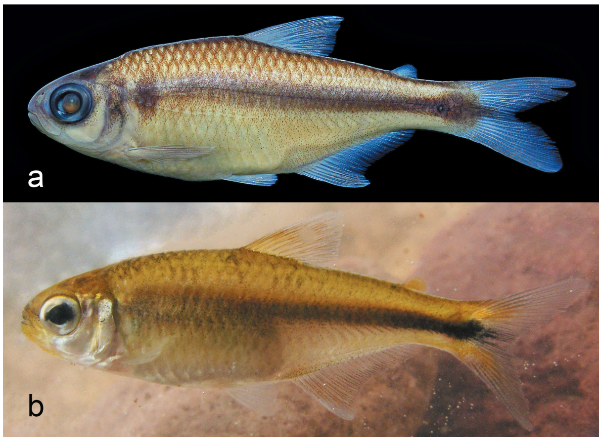
Fig. 1. Astyanax varii , Brazil, Bahia State: (a) MZUSP 121062, holotype, 41.4 mm SL, Ubaitaba, lower rio de Contas basin, rio Coricó; (b) live paratype, not catalogued.

Astyanax sp.—Barreto et al. (2018): 1158 [citation; co-occurrence with Nematocharax varii ].