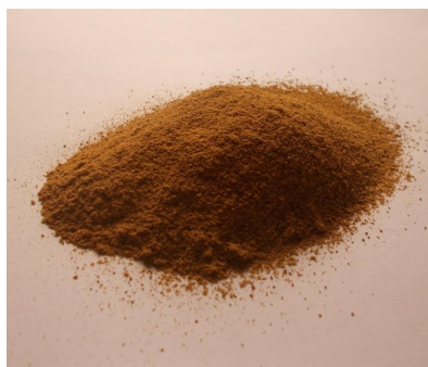
Fig. 1. Aubergine powder [6]

The devices for conducting the experiments are presented on Fig. 2 .