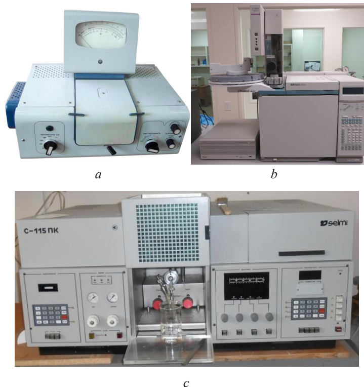
Fig. 2. Devices for conducting the experiments: a – photocolorimeter CPC-2 (“Zagorsk optical-mechanical plant”, Russia); b – gas chromatograph HP 6890 («Hewlett Packard», USA); c – spectrophotometer S-115 PC (PC «Electron», Ukraine)

For obtaining the reliable values of experimental data, all studies were conducted no less than three times, making two parallel determinations at each experiment.