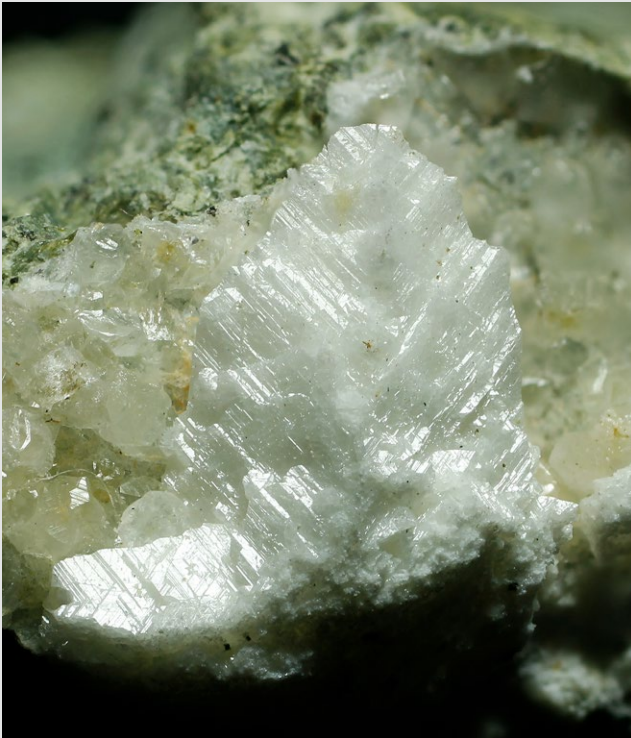
Garronite-Ca crystals in oriented growth. Barranc Salat, Calpe, Alicante. Height of group 11 mm. Miguel Calvo collection.

current correct nomenclature for specimens with calcium dominating is Garronite-Ca.