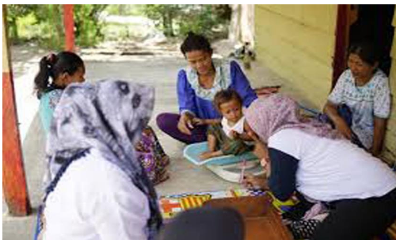
Figure 5. Health education from home to home by doctors and village midwives

In terms of handling this health problem, it is also find that there were very few health workers so that it was often difficult if only the village midwife moved to check the health of residents in the village of Pompa Air, with a collaborative effort with Pertamina EP Jambi, the problems in the Pompa Air Village gradually resolved. It cannot be most separate from that the government collaborated to send doctors to remote indigenous communities in the village of Pompa Air to conduct various health education.