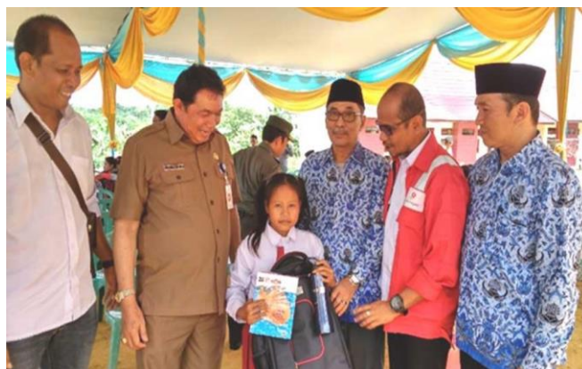
Figure 8. Providing educational assistance to remote indigenous community children in the Air Pump Village