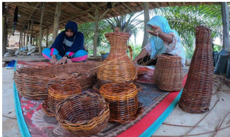
Figure 6. Resam woven training

In this case, the implementation of the training carried out by Pertamina facilitates this activity in the form of consumption and activity support tools, while the government facilitates a place and trainers for this activity.