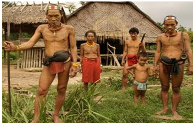
Figure 3. Situation Suku Anak Dalam at Pompa Air Village, Jambi, Indonesia

SAD more often to move, their movement is not just to build or because there is a family who died, but due to the forest, which is widely used as a rubber plantation, oil palm, or as an agricultural area (Wibawa 2017). SAD's interaction with the people outside their tribe, which they call the bright people, has long been established. If in the past SAD was very afraid of meeting with the bright community (as the general public called it) because it assumed that the bright community was a human eater and did not want to meet and interact, besides that SAD was also afraid when leaving the forest and leaving the forest-wide open for the bright community to get land, SAD established sudung or SAD's stilt house to be their residence, if the forest area they inhabit is already difficult hunted animals and their food sources are lacking, and their families have died then they move, this culture is called building, and that's the life of this SAD onwards (Idris 2017).