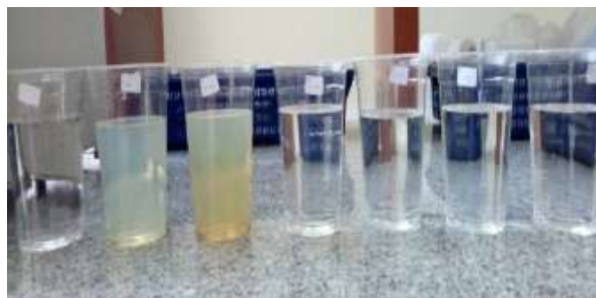
Figure 1. Examination of Tahongai leaves in killing larvae of Anopheles sp.

An increase in percent mortality of test larvae was in accordance with the increased concentration of Tahongai leaf extract which was exposed to the test larvae for 24 hours. Concentration of 0.5 mg/mL with 68% larval mortality as much as 68% of larvae, concentration of 1 mg/mL with 88% larval mortality of larvae, concentration of 2 mg/mL of larval mortality of 100% larvae, concentration of 4 mg/mL percent of mortality larvae as much as 100% larvae, and at a concentration of 8 mg/mL percent mortality of larvae as much as 100% larvae.