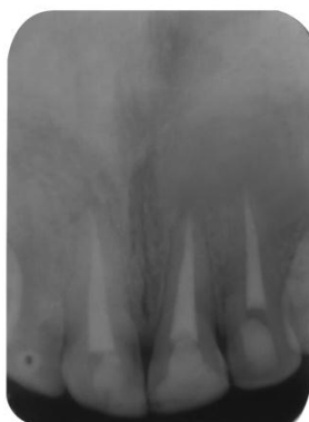
Fig 6:- Disappearance of the lesion regarding # 22.