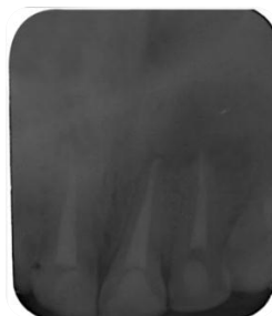
Fig 3:- Beginning of regression of the periapical image after two months of the treatment.