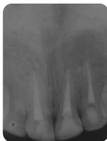
Fig 4:- Beginning of regression of the periapical image after four months of the treatment.