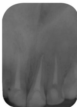
Fig 5:- Regression of the periapical image after four months of treatment at 11 and bone apposition regarding #22.