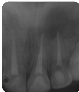
Figure 2:- Prot operative retro-alveolar radiograph showing the RCT on #11, #21 & #22.

the endodontic treatment shows a lack of obturation at the last apical millimeter on the #21, and it was performed without any rubber dam as reported by the patient. As a result, it was decided to renew the endodontic treatment as a safety measure.