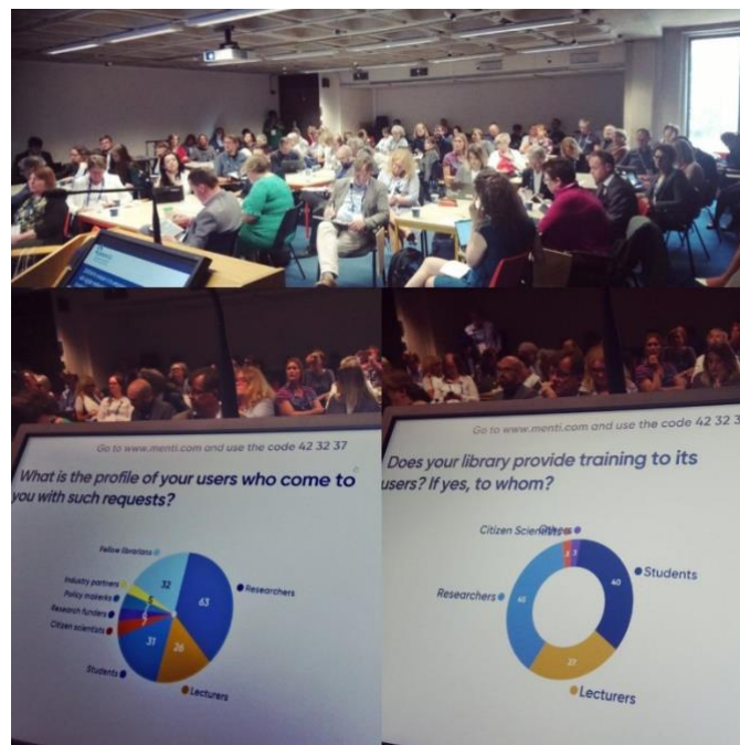
FIGURE 2: MENTIMETER SESSION AT LIBER 2019