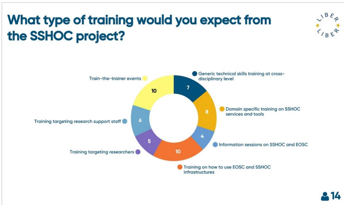
FIGURE 3: FIGURE 3: MENTIMETER SAMPLE 1

The questions of the sessions were tailored to the audience and sometimes made more domain specific, such as the session at the EOSC Symposium, where the focus was cultural and social data and most of the participants had a data management background. Below are a few snapshots from the Mentimeter sessions and feedback.