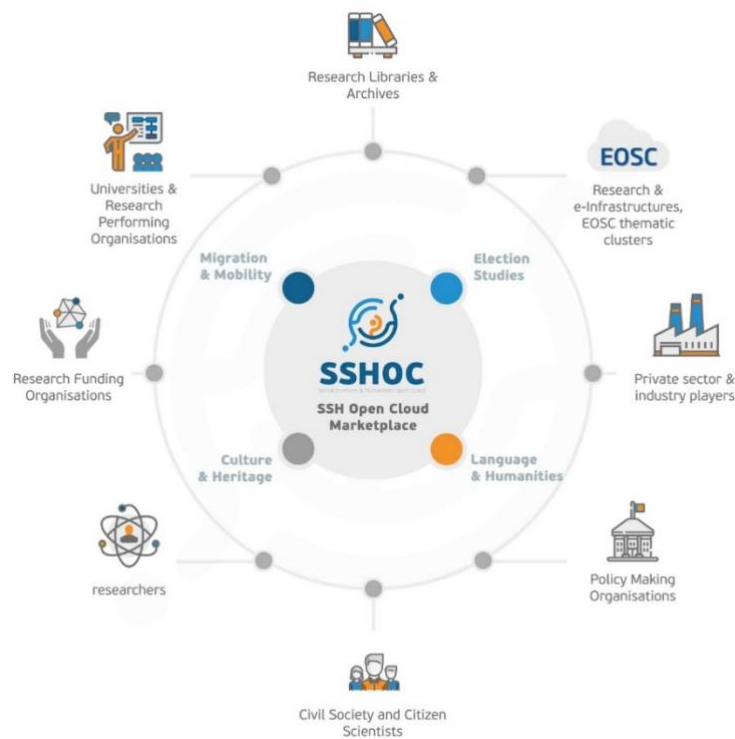
FIGURE 1: SSHOC STAKEHOLDERS

Users of SSHOC span many categories. They include scholars from the broader SSH domain, data producers, open-source communities (developers and users); industry players well beyond the consortium (start-ups, SMEs and large companies); EU-funded projects and SSH clusters; public administrations and public services (libraries), to enable socio-economic impact. Figure 1 presents the priority stakeholders for the SSHOC output.