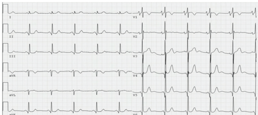
Figure 1: ECG showing Bifid P wave in Left Atrial Enlargement.

eighty percent of patients, further complicating the disease. [6] Atrial stasis, a hallmark of advanced left atrial dilation, is evident on echocardiography as spontaneous echo contrast and is generally a result of multiple factors, most significant of those being forward flow obstruction, disorganized electrical activity, and increased size of the left atrial cavity. Left atrial anteroposterior diameter was one of the first standardized echocardiographic parameters for the estimation of left atrial volume. [7] It is noteworthy that the enlargement of the left atrium is not uniform in most cases. The rate at which it enlarges varies in different planes, which leads to pathological mechanical modifications in the left atrium. Left atrial volume or its changes may not be accurately reflected by using a single linear dimension. The volume of the left atrium is a more sensitive parameter than the diameter of the left atrium, to assess any increase in left atrial dimensions. [8,9] The following study aims to determine the correlation of atrial fibrillation with left atrial volume in patients with mitral stenosis.