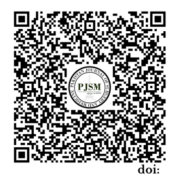
10.5281/zenodo.3595027 Submission: Oct 2, 2019 Acceptance: Jan 20, 2020 Publication: Feb 1, 2020