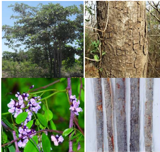
Figure 1: Plant, flower and stem bark of Dalbergia lanceolaria L.