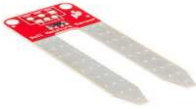
Fig.3.3 Moisture Sensor