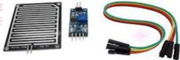
Fig.3.1 Rainfall Sensor

The most widely recognized present day downpour sensors depend on the standard of all out inside reflection an infrared light is transmitted at A 45 degree point into the windshield from the interior [5]. A downpour sensor or downpour switch is an exchanging gadget initiated by precipitation. The level of rain water in the pots can be detected.