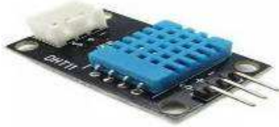
Fig 3.4 Temperature Sensor

Temperature sensors measure the measure of warmth vitality or even chilliness that is produced by plants enabling us to "sense" or distinguish any physical change to Temperature creating either a simple or computerized yield to the microcontroller.