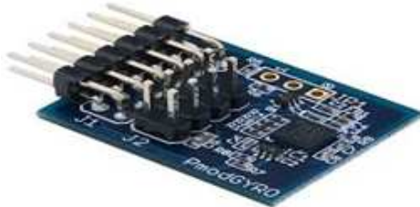
Fig 3.5 Gyro Sensor

Gyro sensors otherwise called rakish rate sensors or precise speed sensors are gadgets that sense rakish speed [9]. Rakish speed in speed is the change in rotational edge per unit of time rakish speed is commonly communicated in deg/s degrees every second.