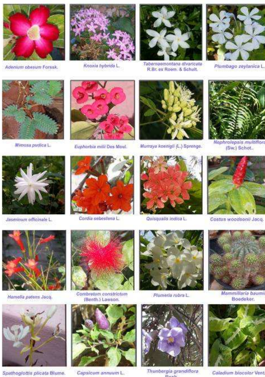
Figure No 3. Selected Plants of Home Garden

In developing countries the nutritional value of local, neglected horticultural species has been assessed and their cultivation in family gardens promoted to guarantee the intake of vitamins and micro-nutrients 22 . In high-income countries the growing demand for healthier life styles and closer connection with nature has driven a renewed interest towards sustainable agricultural systems and "traditional" food products, capable of connecting consumers to the natural and cultural heritage of a community or a geographical region. Many urban citizens of the developed world have taken up some form of self-production of food in their terraces, roofs, gardens or courtyards as well as in communal areas shared among neighbours 23 . For all the enumerated wild and naturalized plant species, information such as botanical name, vernacular name, family and habit are provided and plant species in the checklist and their photographs are showed in (Fig3).