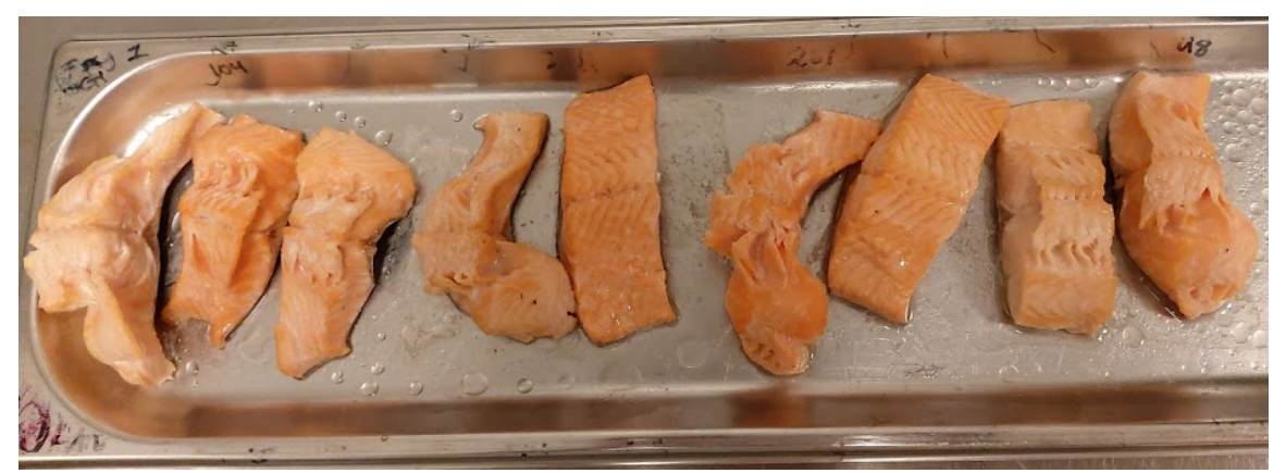
Figure 4. Arctic char samples from end of Trial 2, after cooking for 8 minutes and cooling for 30 minutes at room temperature (cooking yield). Counting from left to right, very deformed samples are: nr. 1, 4 and 6. Slightly deformed samples are: nr. 2, 3, 8 and 9. Samples nr. 5 and 7 are normal in appearance.

Group Initial fish had less cooking yield than slaughtered fish at end of both Trial groups. Cooking yield for group Initial fish was on average 88% but 91% for end of both Trial groups. (p = 0,014). After cooking, the appearance of some samples was unusual, deformed and shrunken (Figure 4).