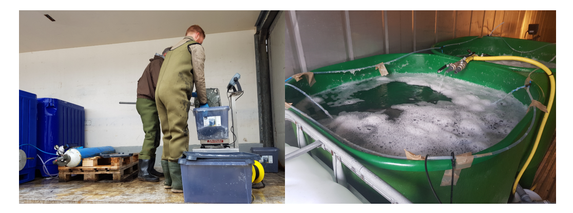
Figure 2. Arctic char transferred to the RAS tanks used for the trials

For Trial one approximately 130 kg of fish were delivered to MARS (Keldnaholt, Reykjavík) on the 16^{th} of September 2019; thereof about 120 kg used for the trial (approx. 59 kg in Tank 1 and 61.8 kg in Tank 2). For trial two about 255 kg of Arctic char were delivered to MARS on the 26^{th} of September and thereof approximately 230 kg were used for the trials (about 119 kg for Tank 1 and 112 kg for Tank 2). It should be noted that the two holding tanks were connected so they served as a duplicate. To transfer the fish into the 2 x 1 m<sup>3</sup> tanks, first the sea water from the transport tubs was pumped into the tanks. The fish was then transferred in batches, using a large fishing net into 10 litre boxes with the seawater, weighed and then transferred into the tanks.