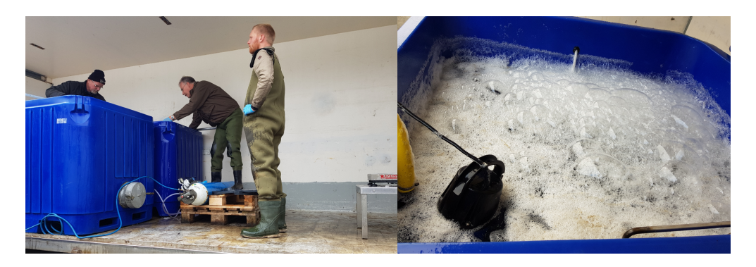
Figure 1. Tubs and the system used to transport Arctic char from Grindavík to Matís

For Trial one approximately 130 kg of fish were delivered to MARS (Keldnaholt, Reykjavík) on the 16^{th} of September 2019; thereof about 120 kg used for the trial (approx. 59 kg in Tank 1 and 61.8 kg in Tank 2). For trial two about 255 kg of Arctic char were delivered to MARS on the 26^{th} of September and thereof approximately 230 kg were used for the trials (about 119 kg for Tank 1 and 112 kg for Tank 2). It should be noted that the two holding tanks were connected so they served as a duplicate. To transfer the fish into the 2 x 1 m<sup>3</sup> tanks, first the sea water from the transport tubs was pumped into the tanks. The fish was then transferred in batches, using a large fishing net into 10 litre boxes with the seawater, weighed and then transferred into the tanks.