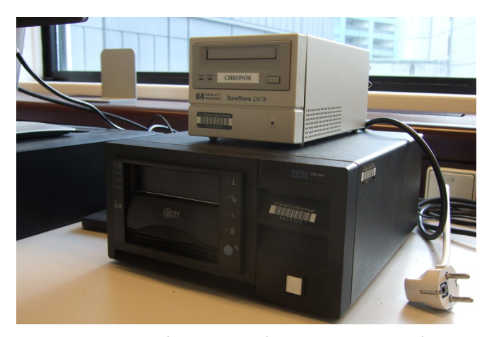
Figure 2: DLT-IV (bottom) and DDS-2 (top) tape drives

iPRES 2019 – 16th International Conference on Digital Preservation September 16 – 20, 2019, Amsterdam, The Netherlands.