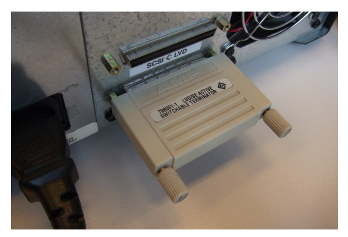
Figure 4: SCSI terminator attached to DLT-IV drive