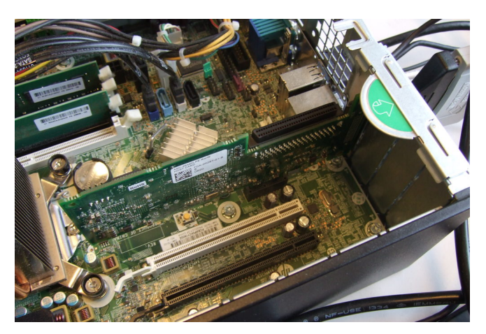
Figure 3: PCI Express SCSI host adapter

iPRES 2019 – 16th International Conference on Digital Preservation September 16 – 20, 2019, Amsterdam, The Netherlands.