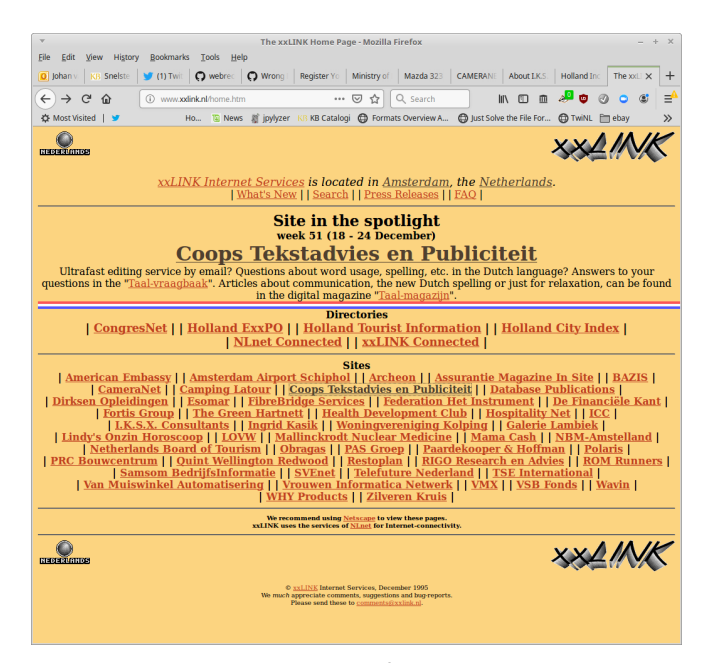
Figure 6: xxLINK home page

<sup>37</sup>These steps are described in more detail here: https: //github.com/KBNLresearch/nl-menu-resources/blob/master/ doc/serving-static-website-with-Apache.md