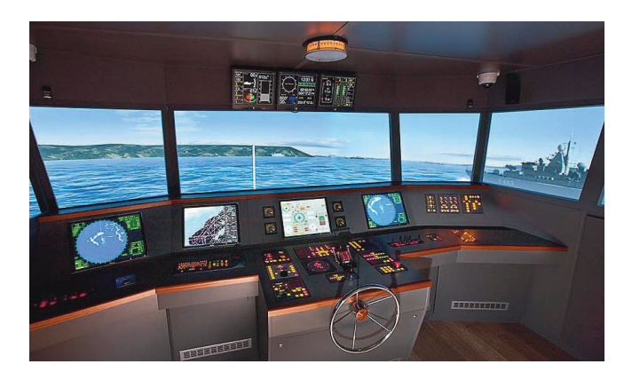
Figure 4: UoP ship simulator (bottom)

pertains to national security, and the equipment necessary to represent shipping environments is much more expensive than more traditional security labs, it may be overlooked as a research field. Providing a space where government industry and academia can pool resources and research efforts will be of significant benefit to all those involved with maritime. While this maritime-cyber lab aims to provide next generation research capabilities, it is not intended as a stand-alone solution. As seen in Figure 1, the Cyber-SHIP lab is meant to be integrated with other existing facilities. In this case, the lab is able to connect to other UoP facilities, including its cyber-range and ship's bridge simulator (Figures 3 and 4 respectively).