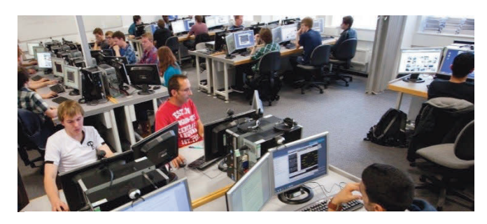
Figure 3: UoP cyber-range

It is important to recognise that, although researching maritime cybersecurity is crucial, it is not currently an easy area of research. As maritime cyber data is scarce, commercially sensitive, or