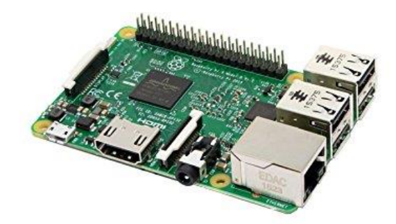
Figure 1: Rasberry Pi module B.

Raspberry Pi to promote the teaching of basic computer science. A modified version of Debian Linux controls the raspberry pi optimized for the ARM architecture. Here, we are using raspberry pi B. The setting up consists of selecting Raspbian OS from prebuilt SD card. The prebuilt SD card consists of Raspbian, arc Linux, pidora, open ELEC and RISC OS operating system. After the OS selection we configure the raspberry-pi using raspiconfig command. We can enter into raspberry pi desktop using startx command. The raspberry pi 3 features a Broadcom system on a chip (SoC), which includes an ARM compatible central processing unit (CPU) and an on-chip graphics processing unit (GPU, a Video Core IV). CPU of 1.2 and on board of 1 GB RAM.