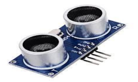
Figure 2: Ultrasonic sensor.

cannot detect it. The sensor uses the time it takes for the sound to come back from the object in front to determine the distance of an object. The distance to the object can then be calculated through the speed of ultrasonic waves in the medium. The ultrasonic sensor can measure distances in centimeters and inches. It can measure from 0 to 2.5 meters, with a precision of 3 cm.