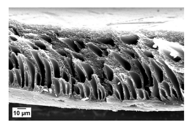
Fig. 2 SEM image of the cross-section surface of PEI membrane

SEM image of the cross-section surface is given in Fig. 2. As shown, the membrane consists of porous and dense structures. The porous layer is generated due to the evolution of the solvent from the polymer. The dense layer determines the gas selectivity and it has an average thickness of 2.8 µm. XRD data are given in Fig. 3 and only two peaks were detected at 21.3 and 23.8 ( 2\theta^{\circ} ) indicating that the sample is purely PEI. Helium and nitrogen permeabilities of the developed PEI membranes are given in Table II. The highest helium permeability was 19.8 Barrer at a feed pressure of 5 bar. The corresponding helium-to-nitrogen selectivity was 80. The highest selectivity was 145 at 10 bar but the permeability decreased to 15.9 Barrer. It is known that in polymeric membranes there is a trade-off between permeability and selectivity meaning that high permeable membranes suffer from the low selectivity, and vice versa. This phenomenon is still unclear but most of the researchers relate this to the nature of polymers [13]. PEI is a glassy polymer meaning that the structure (in molecular level) is more crystalized. Glassy polymers are also known to be more selective but at the expense of the permeability. The high selectivity in glassy polymers is related to the high solubility of the gas inside the polymer. Furthermore, glassy polymers have less free volumes and this limits the gas diffusion and reduces the permeability.