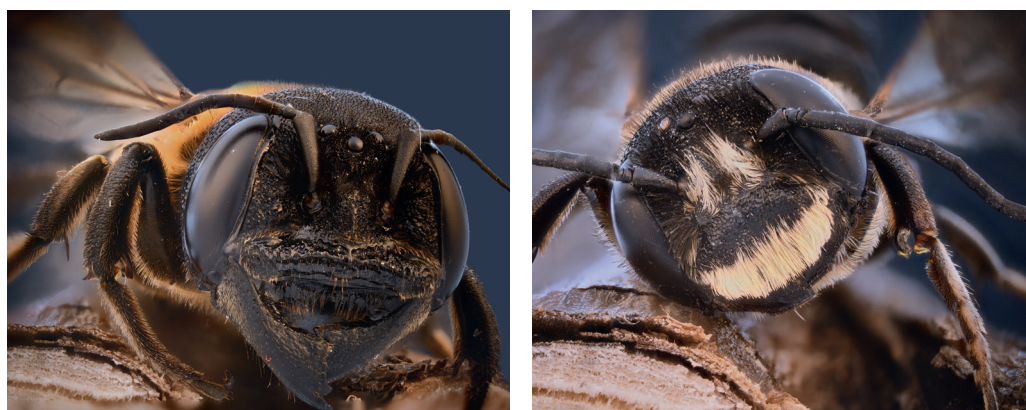
Fig. 1: Head detail of Megachile sculpturalis : Female (left side) and male (right side; second record in South Tyrol, Bruneck / Brunico, July 2019;).