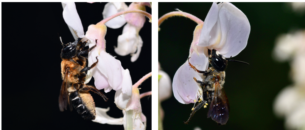
Fig. 2: Megachile sculpturalis . Picture of the individuals recorded in Bruneck / Brunico, South Tyrol, feeding on Wisteria sinensis . Left side: a female with pollen on the abdomen; right side: a male individual. (Second record for South Tyrol, Bruneck / Brunico, July 2019).

M.A. Staggl reported the second record from Bruneck / Brunico (GPS: 46.797237 N, 11.935611 E) in July 2019, where he was able to observe several individuals of both sexes (10 to 15 single individuals were estimated). Here the observations were made over a prolonged period of time (~30 days) and the individuals were observed feeding exclusively on Wisteria sinensis (Fig. 2). At this time of the year only a few inflorescences were found on W. sinensis . The females, in particular, tended to open closed buds to get pollen. In addition, the females first lifted up the typical Fabaceae middle upper petal, the banner, with the head and then bit at the base. They then used the second and third pair of legs to strip the pollen from the flower onto the bristled underside of the abdomen. The females were strongly urged by the males during the collecting activity and often very rough copulations occurred. The males, on the other hand, did not show the same behavior but rather fed on nectar. The brood place could not be located.