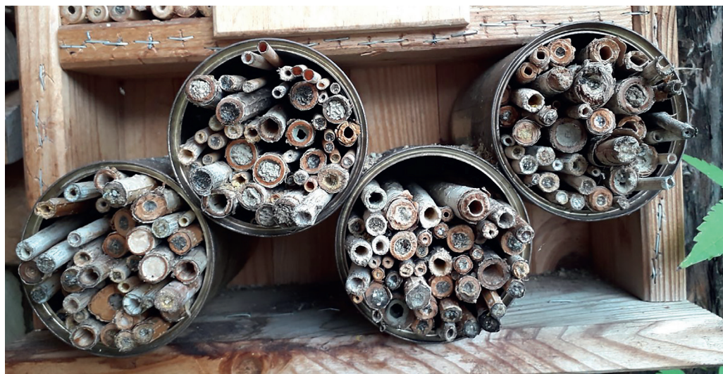
Fig. 4: Megachile sculpturalis was observed breeding at an artificial nest (Fourth record for South Tyrol, Bruneck / Brunico, 30.07.2019;).