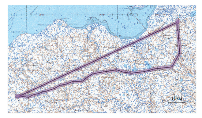
Fig. 2. Scheme of alternative option of pipeline

That is an open source geospatial Foundation (OS-Geo) project and is licensed under the GNU General Public License (Graser 2016).