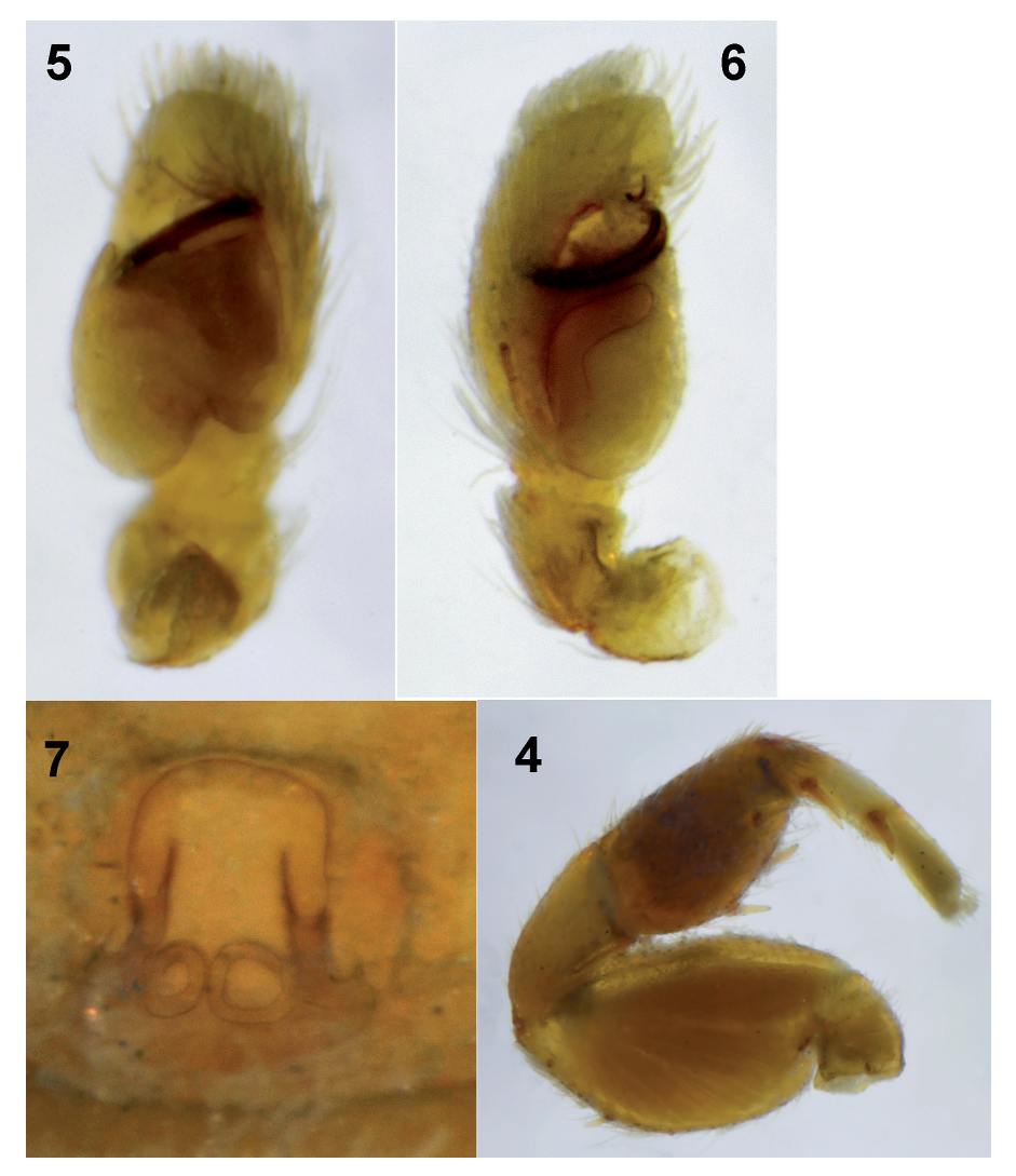
Figs 4–7: Colaxes insularis : (4) first leg of male; (5, 6) palpal organ, ventral (5) and retrolateral (6) views; (7) epigyne.

Diagnosis: The male of this species can be distinguished from other Colaxes spp. by having a very thin, needle-shaped tibial apophysis of the palpal organ, adhered to the cymbium, whereas in other species the apophysis is wider and bent out. The female has the epigyne without a median septum (present in congeners), copulatory openings that are located at the lateral sides of a central depression, with wide space between them, whereas in other species they are close to each other, separated by at most a narrow epigynal septum.