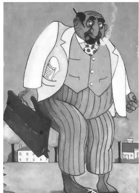
Cigar, saggy bending of the knees, protrusive eyes: this is not Bleistein, but the similarity suggests that the imagery was part of the public discourse.