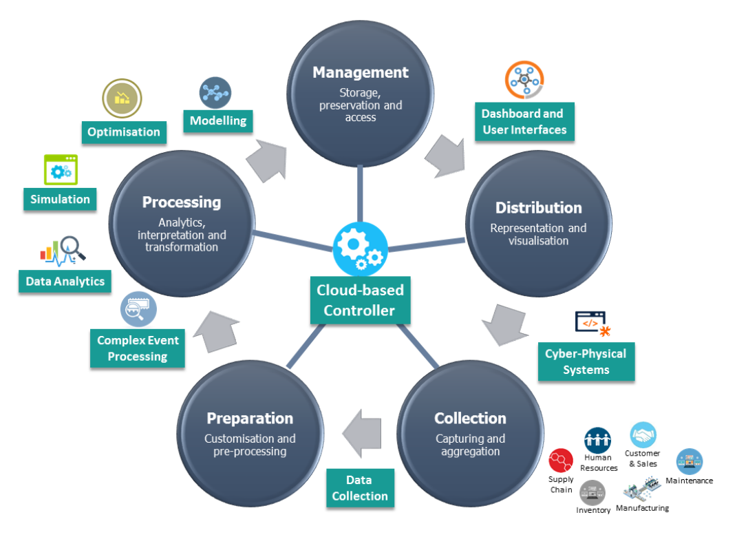
Fig. 1. The lifecycle of multisource, multiscale and multivariate manufacturing data.

mance metrics and achieve the desired business level goals.