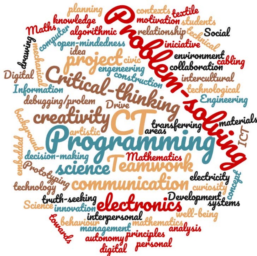
Figure 2. - Competencies desirable to be developed in STEAM activities

Regarding the competencies most of the answers consider the same competencies and the most popular were Computational Thinking, Programming, Problem Solving, Critical Thinking, Teamwork, Project, Communication or Electronics. Competences quite common in STEAM contexts. Figure 1 shows a tag cloud with the competencies described by the partners.