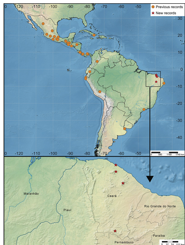
Figure 1. Distribution records of Anelosimus jucundus in the Americas. Orange circles = known records; red stars = new records.