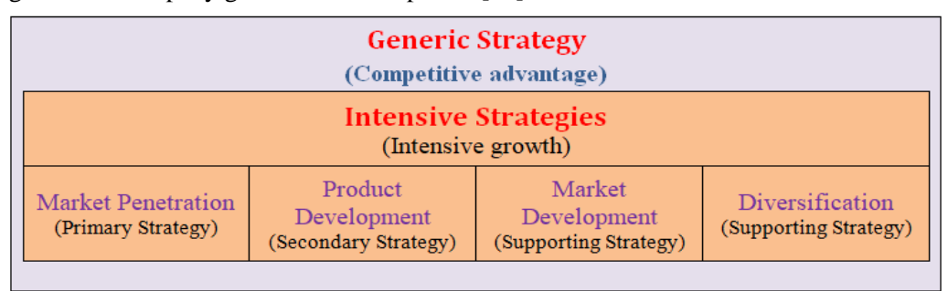
Fig.1: Microsoft's generic and intensive strategies alignment

Microsoft Corporation has adopted two classes of strategies - generic and intensive growth strategies [10] to keep company at competitive advantage in the PC software and hardware business. As shown in below Fig. 1, its generic approach directly intensive approach. This arrangement optimizes companies overall performance. Generally, the generic strategy of a company shows the overall approach to ensuring company competitiveness and intensive growth strategies outline the methods used to guarantee company growth & development [11].