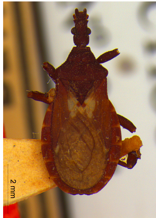
Figure 3. Type specimen of M. trinidadensis deposited in the Triatominae Collection at the Oswaldo Cruz Institute (CTIOC), Rio de Janeiro, Brazil.

The specimen of M. trinidadensis was collected in the açai palm, a species that is associated with cases of Chagas disease in the northern Amazon (Beltrão et al. 2009, Nóbrega et al. 2009). The occurrence of M. trinidadensis in this palm could be an epidemiological alert,