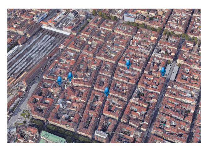
Figure 4. San Salvario area and interactive sound recording on web interface.

In 2017, activities of Acoucité were focused on collecting information on the initial acoustic state of the pilot. For " Movida ", a set of audio recordings was performed in May 2017, with a twofold objective: providing other partners with recordings to initialize the development of sound source identification algorithms and developing a prototype of interactive qualitative maps of the sound environments of the sites (Figure 4), with and without the noise sources to be reduced (in our case, nightlife).