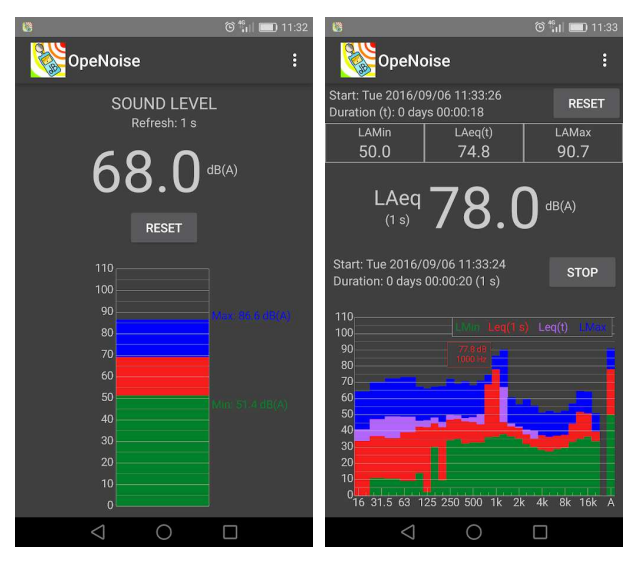
Figure 1. OpeNoise app: standard interface and advanced third-octave analysis

The Regional Environmental Agency of Piedmont (ARPA Piemonte), in order to assess the accuracy of environmental noise measurements using entrylevel smartphones, carried out two different types of tests, comparing output data of smartphones using different external microphones and a Class I sound level meter, in an anechoic room, and carrying out, for more than three months, a longterm environmental noise monitoring [12].