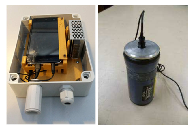
Figure 2. Kit for external installation and calibration of Lavalier microphone with a Class 1 source.

Where ready, this new prototypal low - cost noise monitoring system based on smartphone devices, Lavalier external microphones and OpeNoise app (Figure 2) was deployed in San Salvario area, where six measurement points were installed in summer 2016 [14].